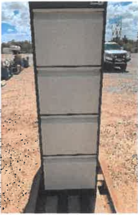
FOUR DRAWER FILING CABINET